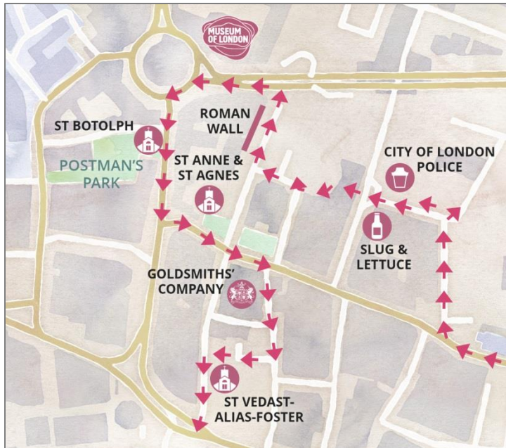
Route map 2

The Church of St Mary Aldermanbury was another church that was destroyed in the Great Fire of London, rebuilt by Christopher Wren then badly damaged again by bombs in the Second World War. However, whilst the interior was destroyed, much of the exterior survived and, amazingly, in 1966 stones from the ruins were transported to the Missouri Westminster College, in Fulton, Missouri in America. There they were used to build a memorial to Winston Churchill, who had made a famous speech there in 1946.